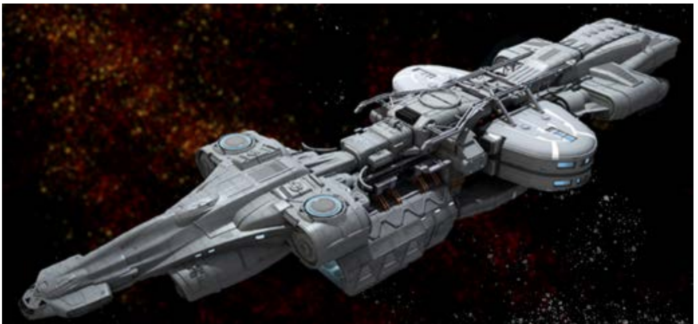
The RNLS Fairchild, where the murders took place

Over the past few weeks Drake Interplanetary technicians have been no stranger to suspicious and damaging incidents. Investigations were already underway following the theft of the personal vehicle of Vice Admiral Taryn Vindex from the pad of the new civilian Kraken, the RLNS Accord, belonging to Zokjin. The thief, a Drake employee whose real name was Svetlana Federov, was killed during a capture attempt, though suspicions have fallen on the Drake technicians as a whole under fears that the woman in question may not have been working alone. The two employees sent to the medical bay were put there after an altercation between them and Councillor Pascal Rhet. When the Drake technicians refused the Councillor’s request to leave The Core, things turned ugly and the two men ended up with injuries after attacking Ms Rhet. The Councillor was unharmed during the event,